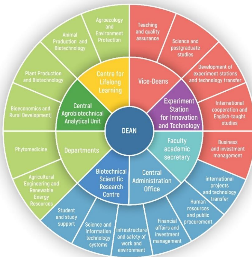
Figure 1. Organisational Structure of FAZOS

Organisational structure of FAZOS is presented by Figure 1. As of the organisational structure, the Faculty is managed by the Dean and five vice-deans as well as by the Faculty academic secretary. The faculty consists of the following units: 6 departments with 30 chairs, Central Agrobiotechnical Analytical Unit (with three sub-units), Experiment Station for Innovation and Technology, and the Central Administration Office. At the Faculty, there are also two centres established: the Centre for Lifelong Learning and the Biotechnical Scientific Research Centre.