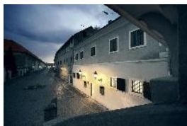
The Waldinger Gallery Address: Fakultetska 7, 31000 Osijek